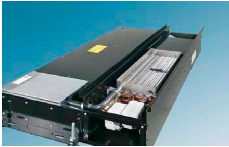
Decentralised air conditioning unit