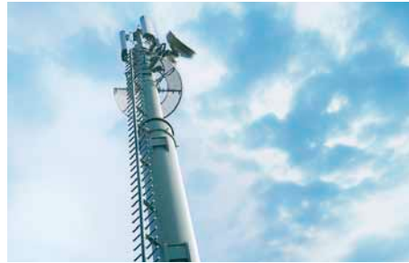
Mobile radio aerial installation