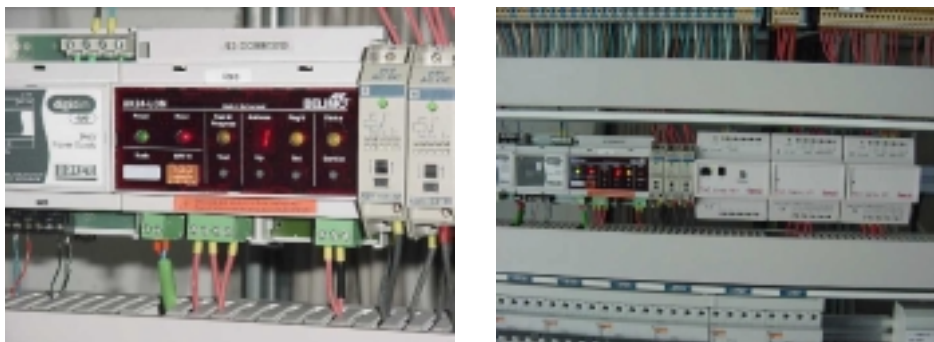
Central adjustment and diagnosis of VAV controllers with UK24LON

Operation of the "room thermostat" is controlled at the personal PC workplace. Depending on where a workstation logs in, the corresponding room operation terminals are assigned. This is a further supporting argument for the use of bus technology in HVAC installations.